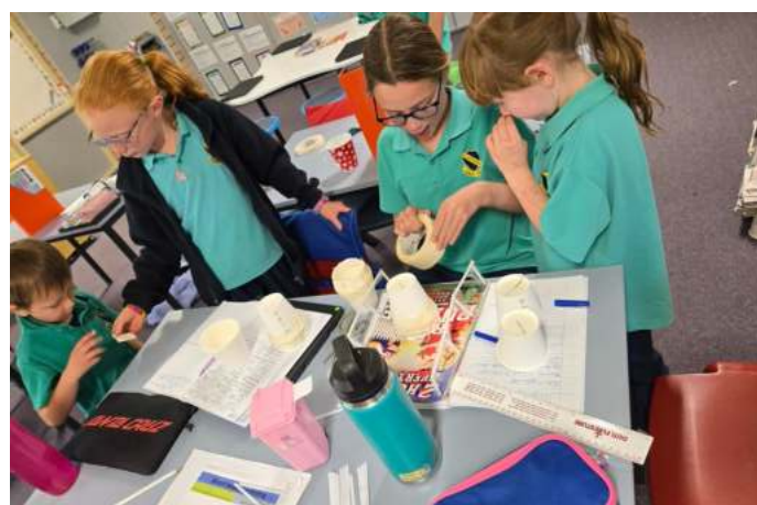
The students building bridges, learning about downward force!

Notes also went out for our 2-6 Borambola excursion, please hand these in to the office at your earliest convenience!