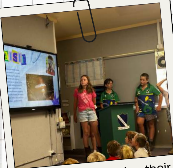
3-6 Class presenting their descriptive paragraphs