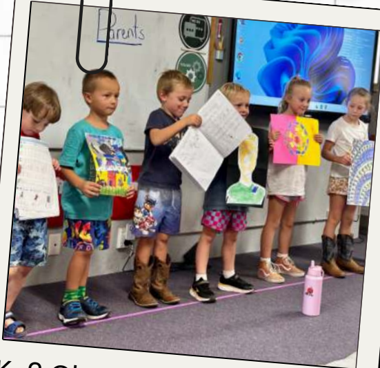
K-2 Class presenting their class work