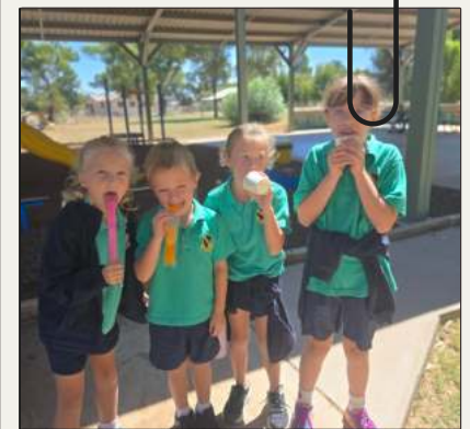
Enjoying ice blocks!