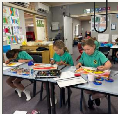
3-6 Class working on their creative drawings